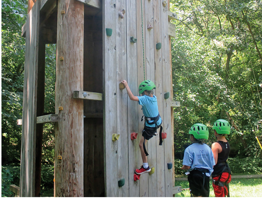
It was another exciting summer of Camp Catch-Up! In 2018, we hosted 3 camps for young people who have been separated from siblings due to involvement with the child welfare system. Camp sessions were held at the Timberlake Ranch Camp (Hordville), Nebraska State 4-H Camp (Halsey), and the Eastern Nebraska 4-H Center (Gretna).