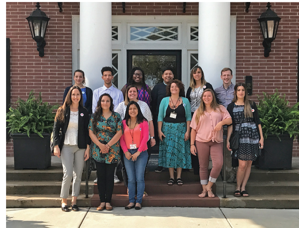
Visiting the Governors Residence

We're excited to see what the CYI team does with everything they've learned from this exchange, thanks to the International Youth Foundation. Even better, as part of the (Re)Connecting Youth program, CYI will receive a $50,000 grant to pilot a program inspired by the learning exchange. 🌱